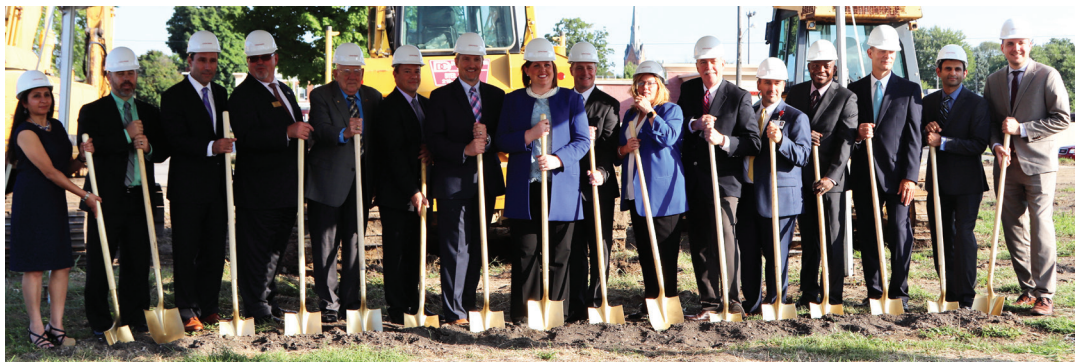
La Porte Hospital Ground Breaking Ceremony

Investors will receive updated information on the progress of the Program of Action and will be invited to Circle of Investors receptions. Investors will also receive special recognition for their support.