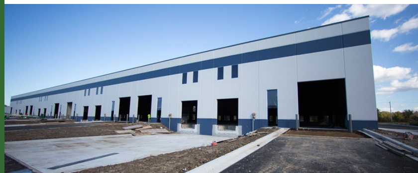
Holladay Properties Haskell Building, completed construction in 2018 of their new 64,000 SF spec building.

“The EDCMC has done a lot of work to position itself for strong rewards in the 2020 year and beyond.